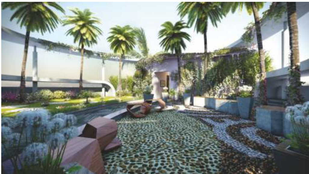
REFLEXOLOGY /ZEN GARDEN