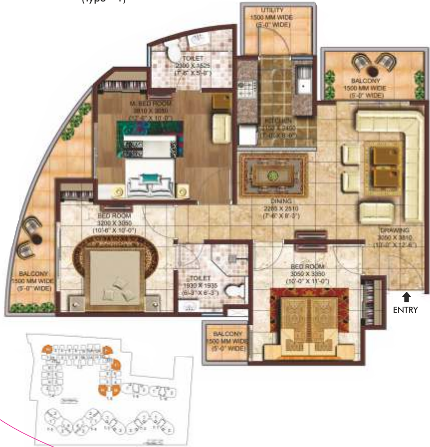
3 Bedrooms + 2 Toilets (1496 sq.ft.) (Type - 1)