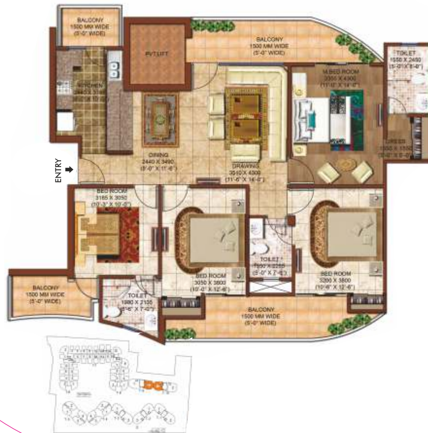
4 Bedrooms + 3 Toilets Units (2095 sq.ft.) (Type - 1)