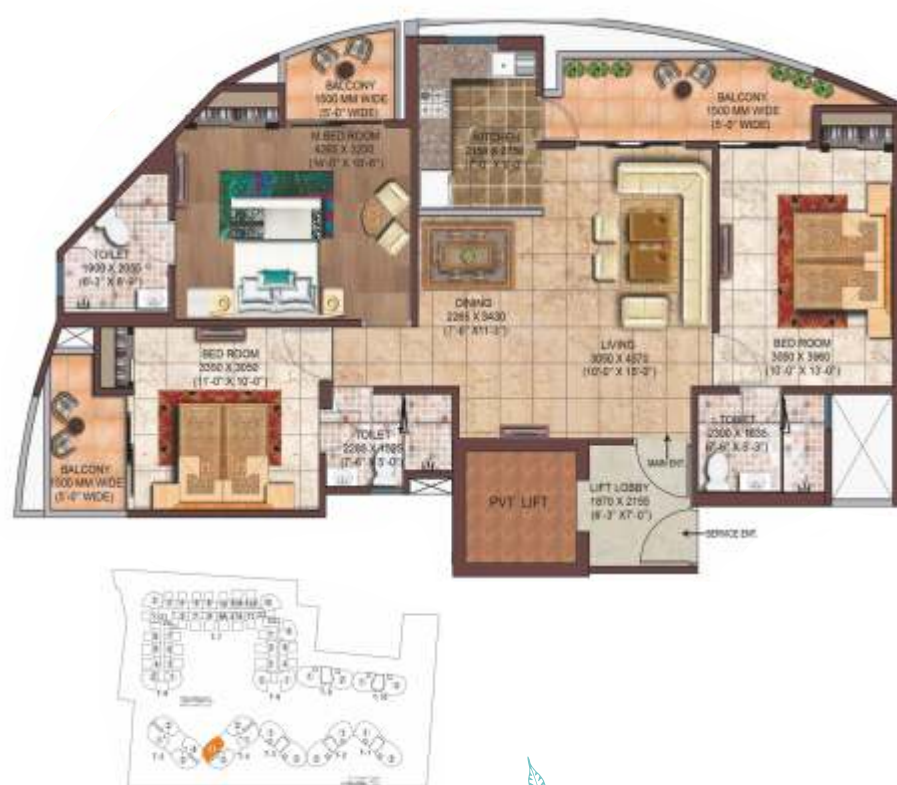
3 Bedrooms + 3 Toilets + Pvt. Lift (1733 sq.ft.) (Type - 1)